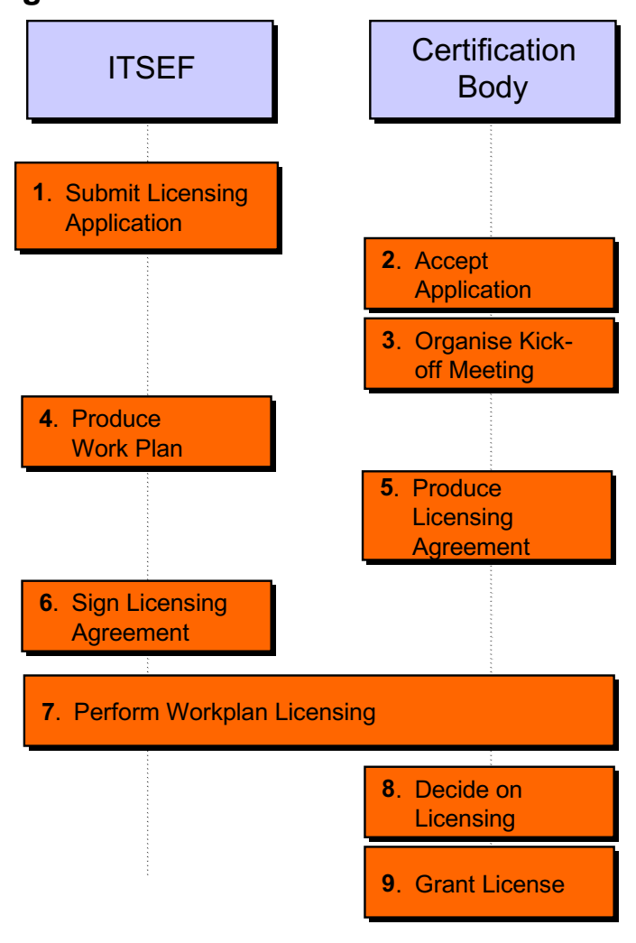
Figure 3-1, Activities and Actors in the Licensing Process